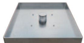
250kN STAINLESS STEEL COVER TO FILL

* Electro pickling and electropolishing with passivation of stainless steel treatment to finish and clean the covers from welding marks