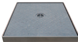
400kN STAINLESS STEEL COVER WITH ALMOND FINISH